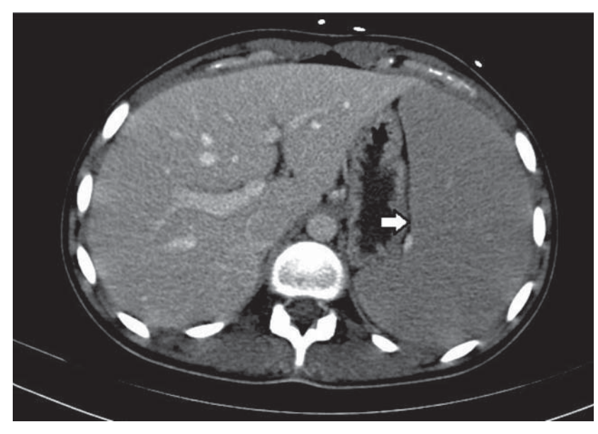
Figure 2. Abdomen computed tomography scan with arterial contrast enhancement. Demonstration of splenomegaly.

equal to 980,000 units per mm<sup>3</sup> and a platelet count of 24,000 units per mm<sup>3</sup>. The peripheral blood exam confirmed the presence of numerous lymphoid